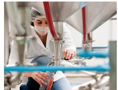
Dairy farms are a major component of North Carolina's food processing industry.

Incubator Kitchens are sprouting up all across the state, providing affordable access to commercial food production facilities and industry expertise.