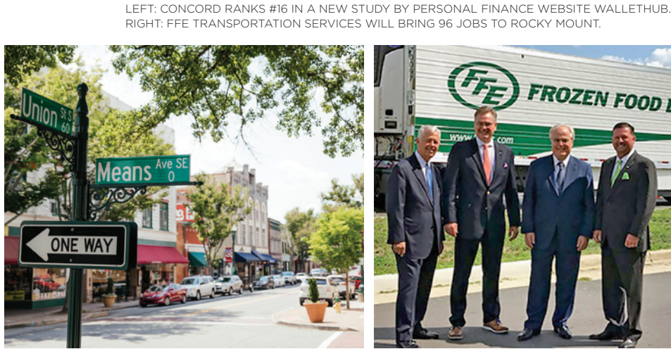
LEFT: CONCORD RANKS #16 IN A NEW STUDY BY PERSONAL FINANCE WEBSITE WALLETHUB. RIGHT: FFE TRANSPORTATION SERVICES WILL BRING 96 JOBS TO ROCKY MOUNT.