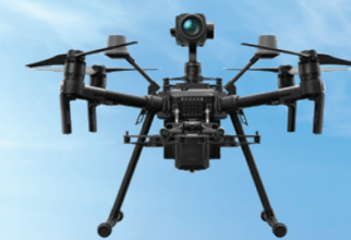
DJI M210 RTK V2

PrecisionHawk , a drone technology company based in North Carolina, received $32 million from venture investors. The financing will fuel innovation in the company's software tool, PrecisionAnalytics, and speed sales initiatives. PrecisionHawk has previously raised more than $100 million.