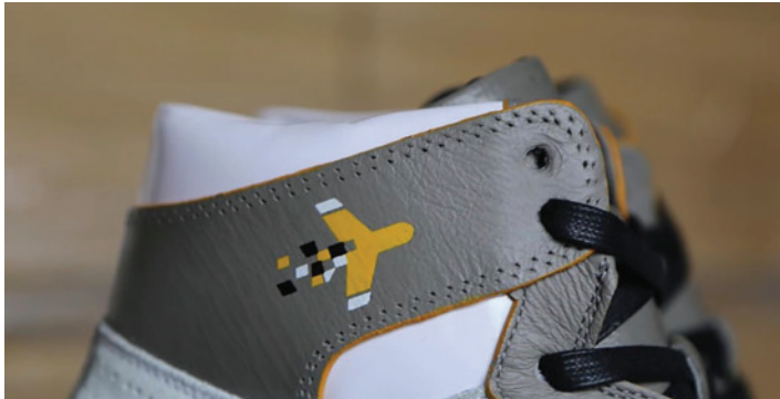
Ceeze, a bespoke designer mostly known for his footwear, has teamed up with Kinston-based aircraft recycler Aircraft Solutions to make a popular line of shoes with airplane trash.