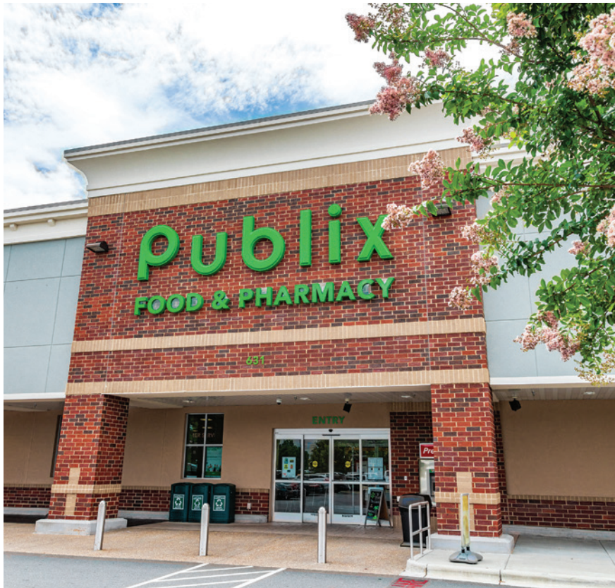
PUBLIX IS SLATED TO OPEN IN NOVEMBER AT MARKETPLACE AT FLOWERS CROSSROADS IN CLAYTON.

GNT USA Inc. will invest $30 million at the new Apple Creek Corporate Center. After years of development work, the Dutch manufacturing firm subsidiary will purchase nearly 50 acres in the new business park to launch a food processing operation. The venture will create some 40 jobs over multiple phases, and the company also intends to source specific vegetables from across the region. GNT is a family-held company that partners with