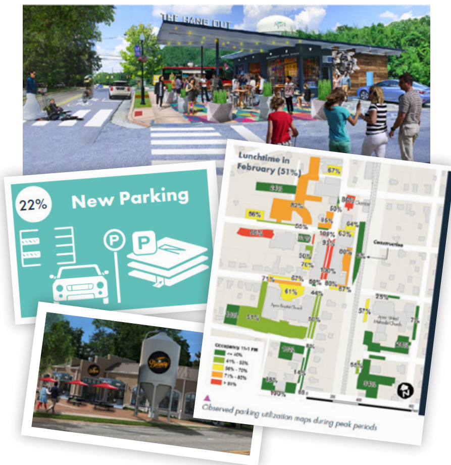
DOWNTOWN APEX CONCEPTUAL PLANS AND PARKING STUDY.

million at a site in Greenville. World Cat, a brand of HC Composites LLC, has been headquartered in Tarboro since 2002. The company won the 2019 Governor’s Export Award as a Top Global Reach Exporter for its strong international dealer network. World Cat will maintain the 180-person workforce at its facility in Tarboro.