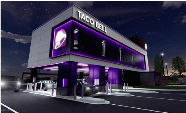
TACO BELL DEFY IS SCHEDULED TO OPEN IN BROOKLYN PARK, MINNESOTA, BY SUMMER 2022.