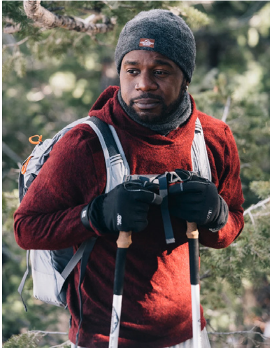
Appalachian Gear Company will expand its manufacturing operations in Kings Mountain.