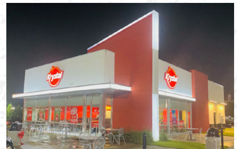
Krystal's newly designed prototype store opened in Dublin, Georgia, in October 2021.