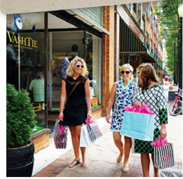
Downtown New Bern