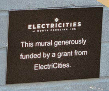
In 2024, the Town of Hertford completed installation of a new sculpture garden and mural, promoting their focus of cultivating the arts and attracting visitors downtown. The project was supported by a $10,000 Downtown Revitalization Grant awarded by ElectriCities.