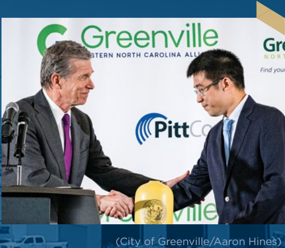
(City of Greenville/Aaron Hines)